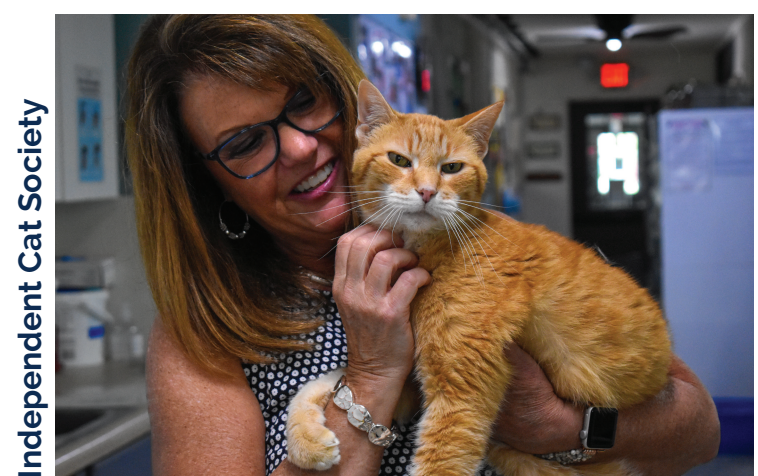
Independent Cat Society