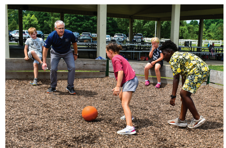
Valparaiso Family YMCA