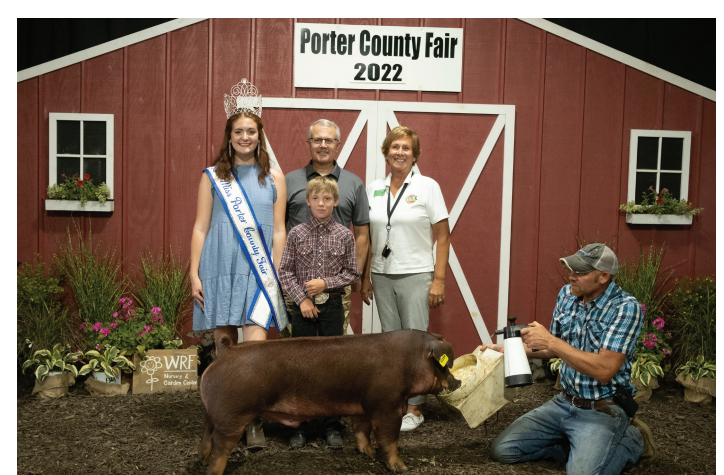
Porter County 4-H Auction benefiting the Food Bank of NWI