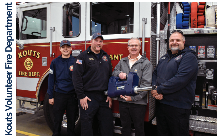
Kouts Volunteer Fire Department

Grants from the Community Fund are awarded through a competitive application process across a wide range of causes . Here are just a few.