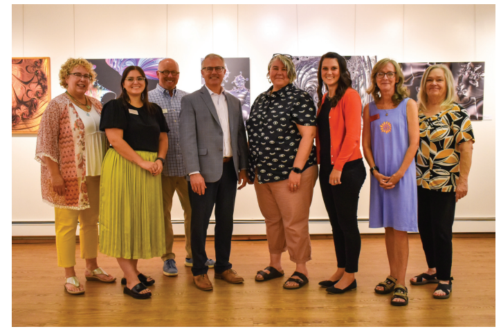
Chesterton Art Center