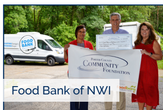
Food Bank of NWI