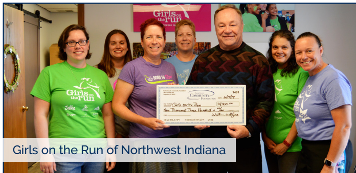
Girls on the Run of Northwest Indiana