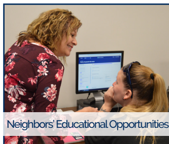
Neighbors' Educational Opportunities