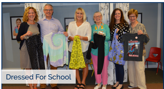
Dressed For School