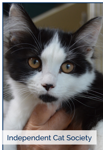
Independent Cat Society