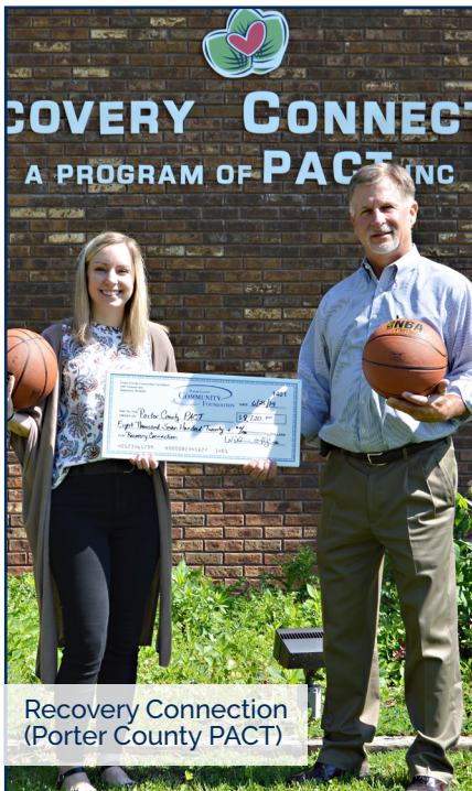
Recovery Connection (Porter County PACT)