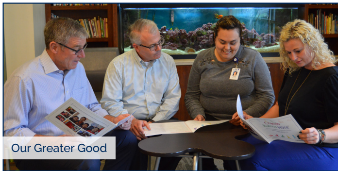
Our Greater Good