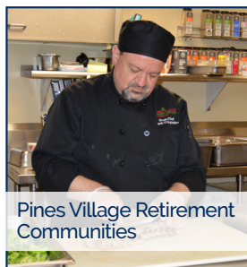
Pines Village Retirement Communities